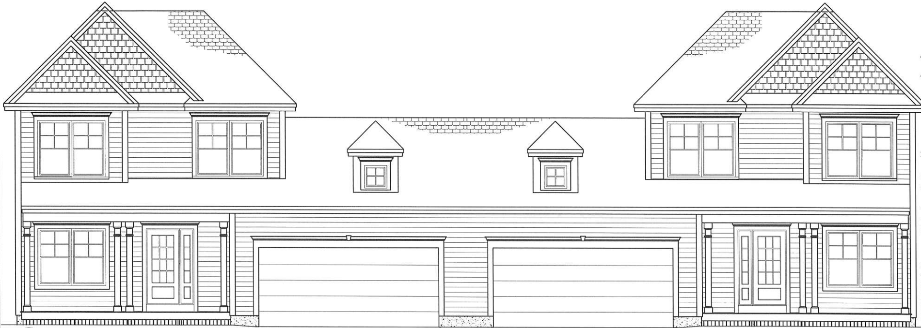
A FRONT ELEVATION N.T.S.