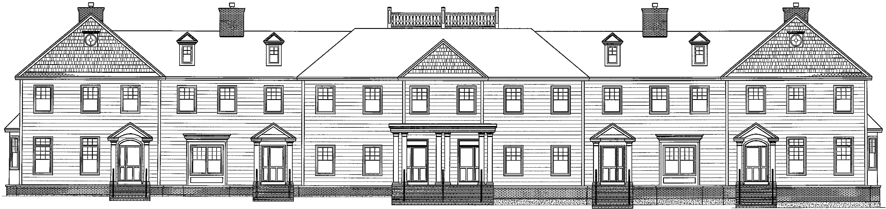
○ FRONT ELEVATION N.T.S. 2148 SQUARE FOOTAGE 15 WALDRON DRIVE