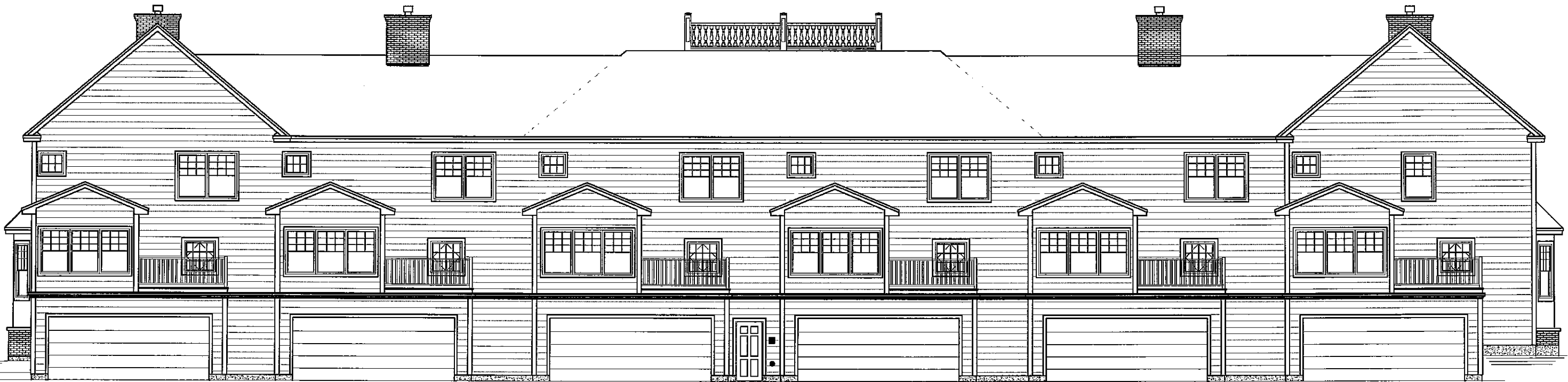
○ REAR ELEVATION 15 WALDRON DRIVE